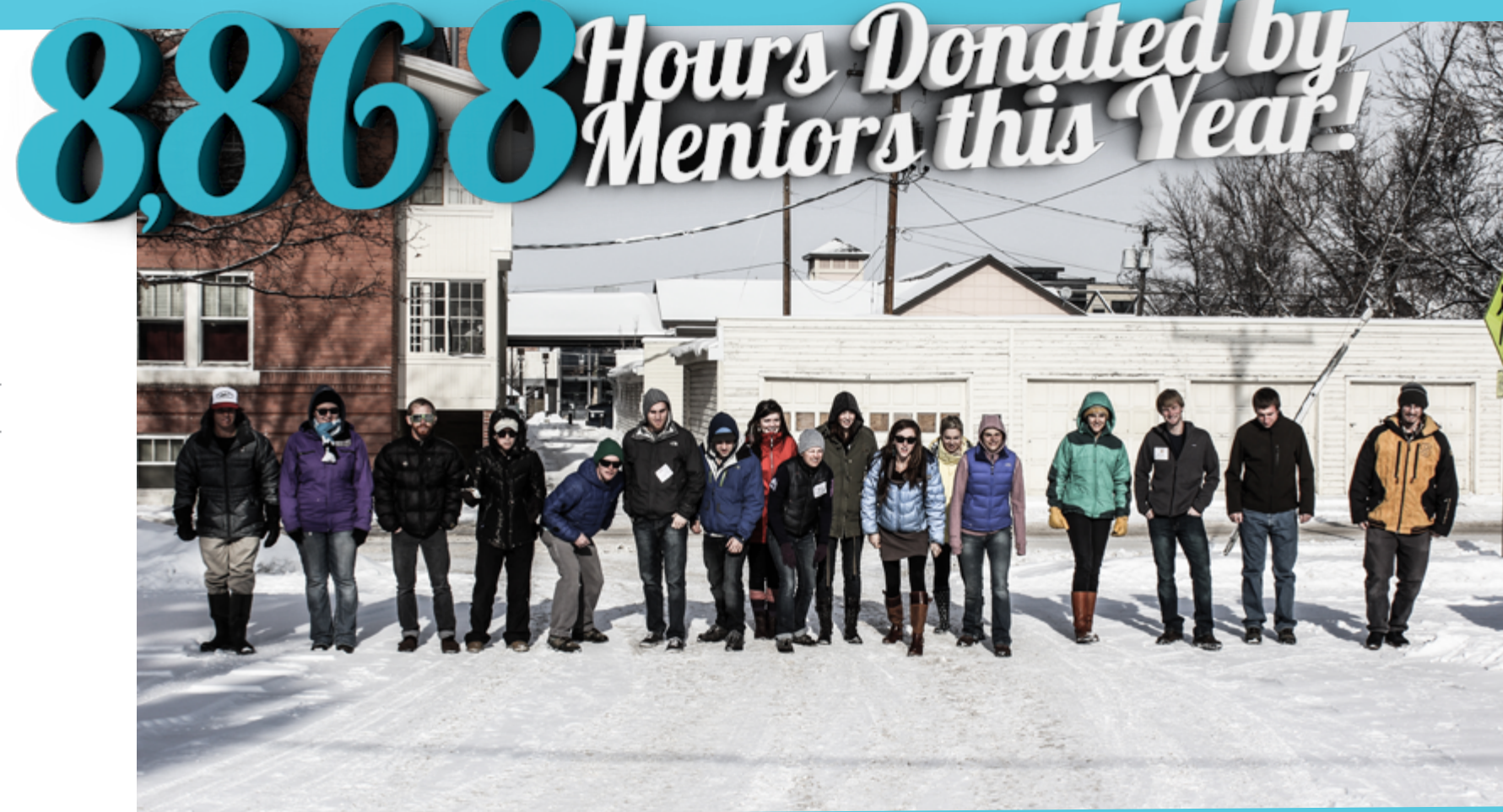
Winter 2013 Mentors participate in a training exercise